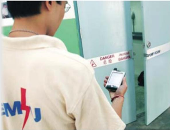
REMOTE-CONTROL DOORS: A technician demonstrates how an SMS sent via a PDA phone to a central operations centre can unlock access doors under the new security system.